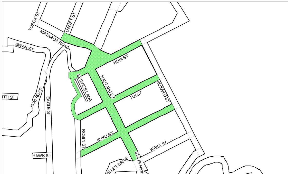
Taihape Central Business District Area All of the prohibited areas are shown as shaded on map.

Huia street (including the Service Lane) from the area known as the "Outback" to Kokako Street.